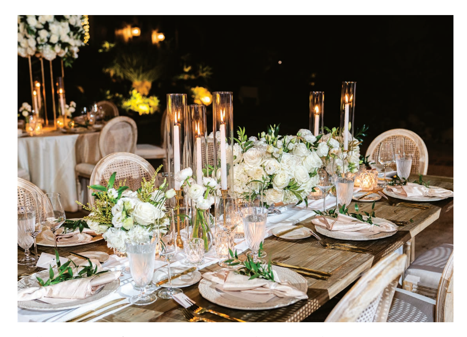
"In a year of lockdown and being an avid concert-goer myself, I wanted the reception to not just be a celebration, but an experience for all of our guests."